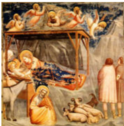
Natività di Gesù Giotto di Bondone (c.1267–1337))